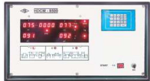
HDCM 8500 Panel