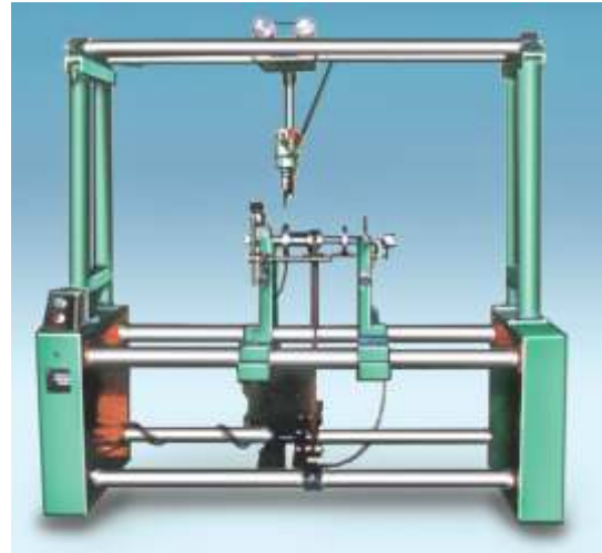
Machine provided with Optional Vertical Drilling Attachment.

For other details please refer "features of measuring panel HDCM-8500".